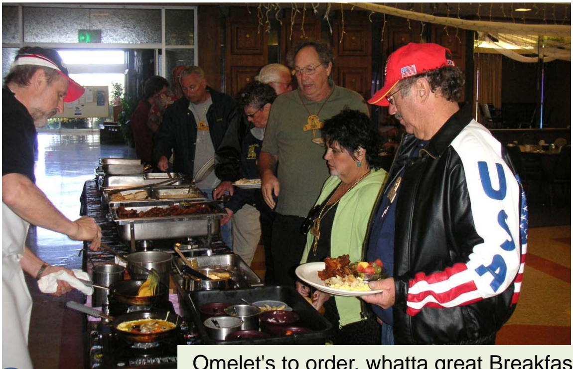
Omelet's to order, whatta great Breakfast!

A flower on the table.... Am I brilliant or what?