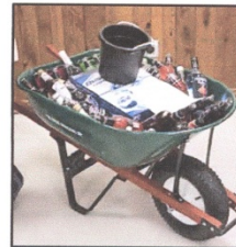
BOOZE WHEELBARROW RAFFLE

HORSE RACES AT GARDEN GROVE ELKS TRACK - FIRST POST AT NOON ON SATURDAY, OCT. 25TH