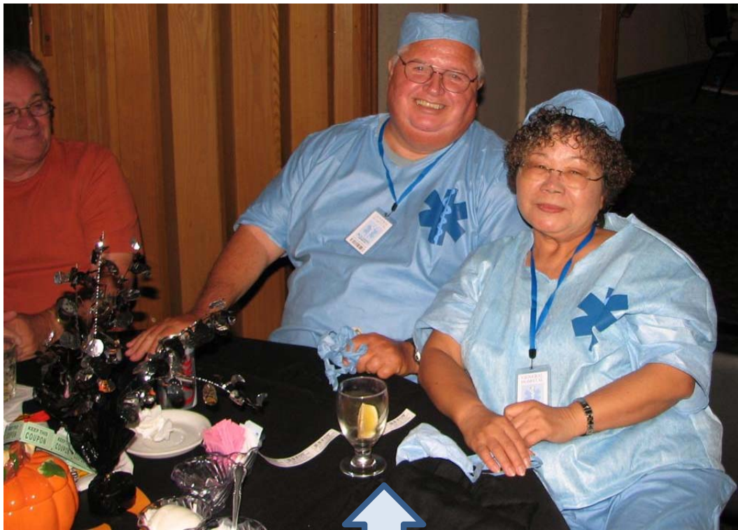
OMG!!! OBAMA CARE IS ALREADY HERE!